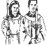
Acolyte for the Month